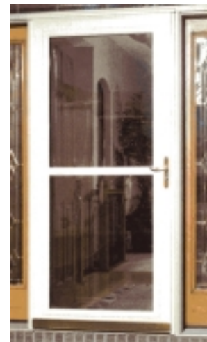
Storm Door for Single French Door